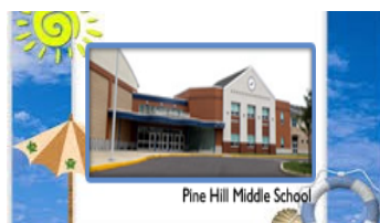
Pine Hill Middle School