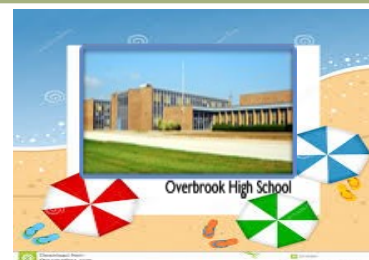
Overbrook High School